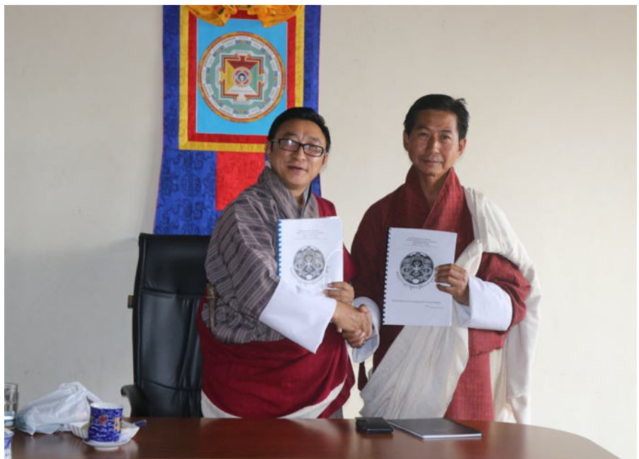
Dasho Dzongdag with Executive Engineer, DoR, Sarpang

A total of 81.224 Kms of GC roads has been handed over to the Dzongkhag Administration.