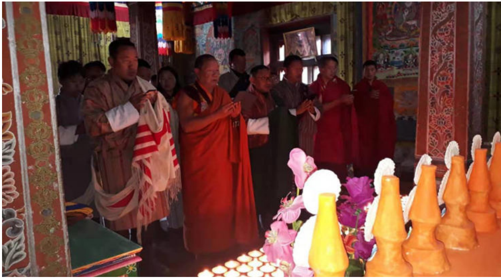
Lam Neten, Dasho Drangpon, Dasho SP and Dasho Dzongrab lead the sector heads and celebrated our beloved HRH Gyalsay Fourth Birth Anniversary in Namgaycholing Dratshang. Part of celebration offered butter lamps and prayers for His Highness Welbeings and everlasting happiness