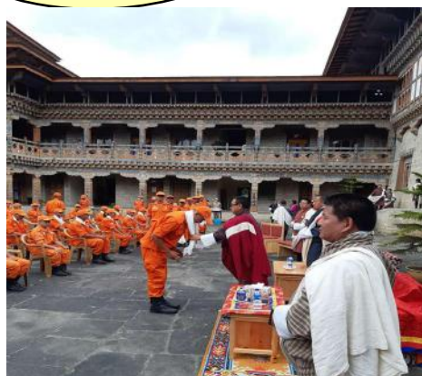
On 27th April with the coincide of auspicious Day

Tsirang Dzongkhag welcomes 38th batch of Desuup (Guardians of Peace) led by Honorable Dasho Dzongdag, Sector heads and Desuup colleagues. Total desuup represented from Tsirang is 128 of which 20 are females. Dasho Dzongdag offer them Khadhar on their successful completion of 3 weeks Integrated Desung Training in Samtse. Most of them are from Education. They were welcome with simple