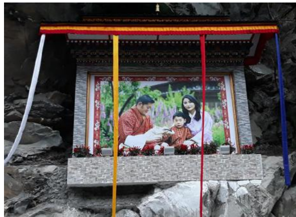
Inauguration of Royal Portrait at Waklaytar and junction near BoD